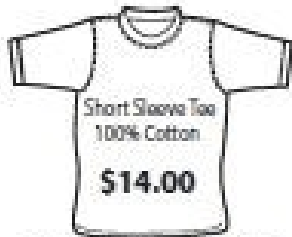
G200 - Small - 3XL