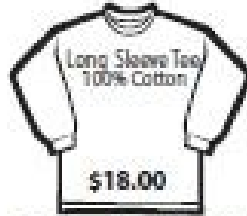
G240 - Small - 3XL