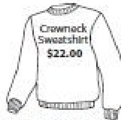
G120 - Small - 3XLarge